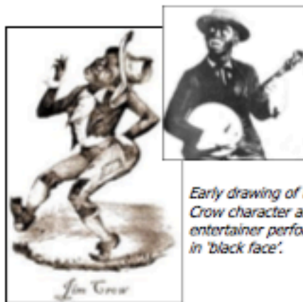
Early drawing of the Jim Crow character and an entertainer performing in 'black face'.

Before the iPod, before television, movies and radio, people went to the theater for entertainment. Daddy Rice, a white actor, would cover his face with charcoal and then sing and dance in a silly way. This character's name was Jim Crow. Just like we compare people to characters on TV, people began to use Jim Crow as a way to describe black people. (It wasn't a compliment.) For example, there were 'Jim Crow' cars on trains where all blacks were forced to sit, even if they bought a first-class ticket! As time went on, the term was also used to describe any racist law that restricted the rights and opportunities of black people.