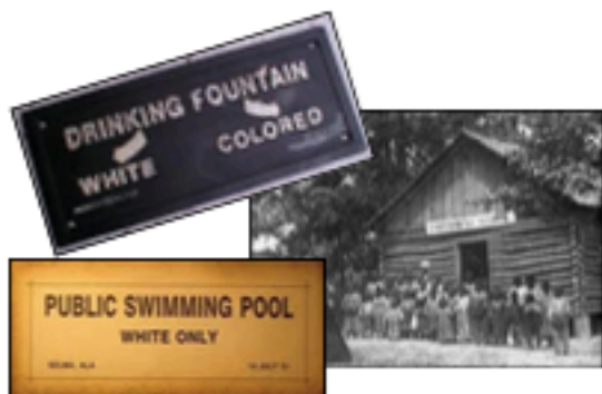
Examples of segregation

By the 1870s, most southern states adopted laws known as Black Codes , creating a legal form of segregation. Segregation is when people are separated by race. These codes limited the rights and freedoms of black people. Northern states varied in the way they accepted the new arrivals, but segregation was common all over the nation.