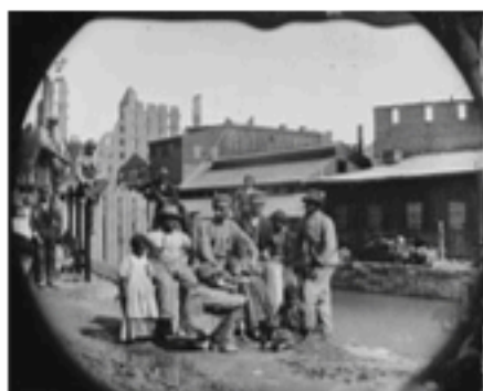
Group of freedmen in Richmond, VA 1865

In the years right after the Civil War, freedmen (former slaves) were able to vote and participate in government, thanks to the 13th, 14th and 15th Amendments and the Civil Rights Acts. Sadly, some people did not understand that freedmen deserved equal rights and opportunities. The federal government had been protecting these rights, but in 1877, Rutherford B. Hayes became president and ended Reconstruction. All of a sudden, there was no one to enforce the new laws and amendments and no authority to punish those who treated blacks unfairly. From then on, people worked to undermine efforts at equality, and states passed laws that greatly restricted the rights and freedoms of blacks living in the South (and the North!).